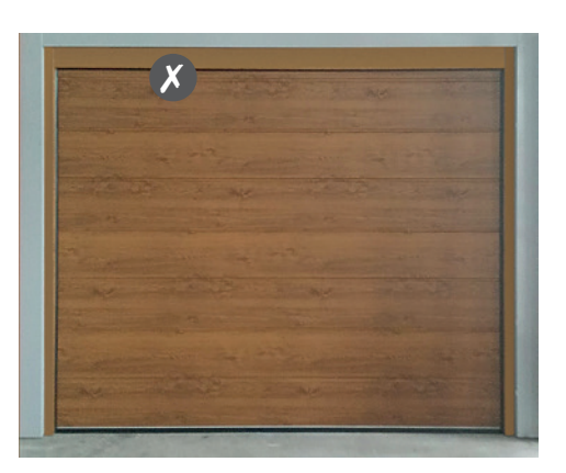
Matching 3-D profiles & renovating angles